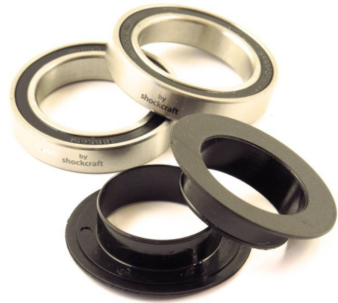
Bearing and Top Hat kit for all MC BB's

Monocrome BB's are fully servicable. Shockcraft has every spare part and a wide range of bearing options, including 19 & 22 mm BMX bearings, Enduro bearings, ceramic hybrids and soon stainless steel.