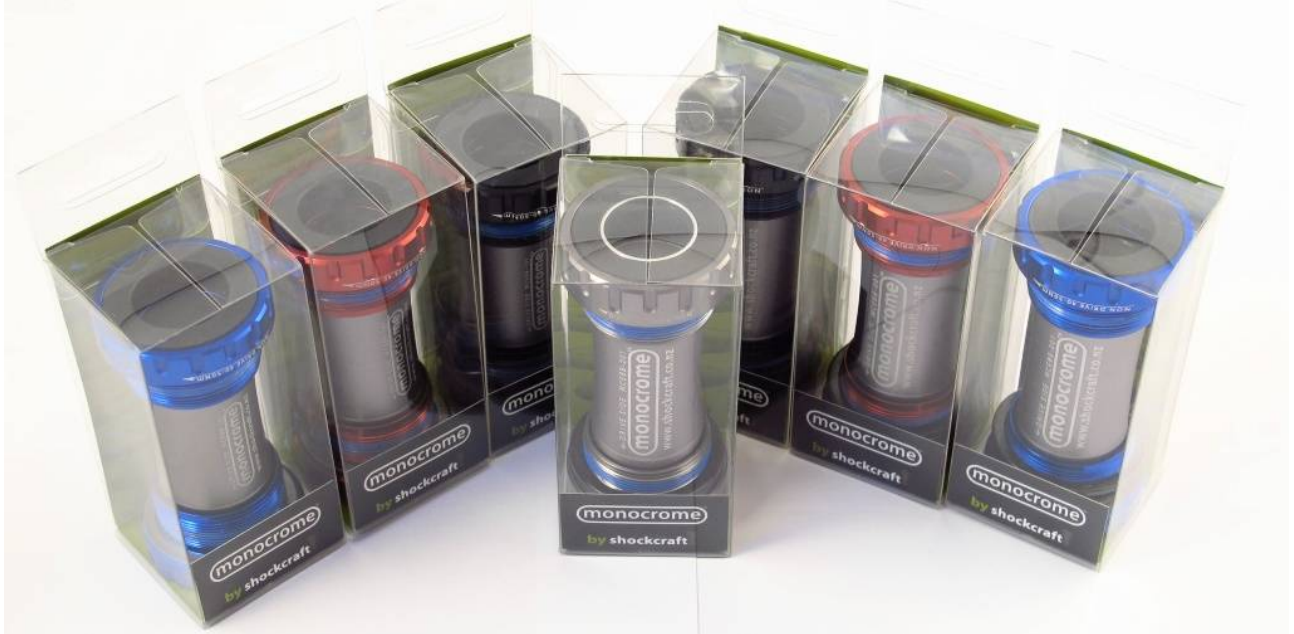
MCEBB-201 Road (left) MCEBB-101 MTB (right), MCEBB-201 Stepped (centre)

The range of Shockcraft's own Monocrome bottom brackets is continually expanding. In addition to the extremely well received original MCEBB-001 in black (to fit Shimano HT2, Raceface X-type & FSA), we now have models to fit Road Shimano HT2 and Truvativ GXP cranksets. All use the same reliable and replaceable bearings.