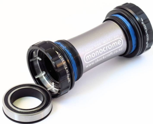
Monocrome MCEBB-001 with CNC Storm Drains

The Road BB's for HT2 are MCEBB-101 and feature the same cups as our MCEBB-001 but with narrower spacers and centre-sleeve. We offer these BB's in black, red, blue and gold. Our MCEBB-201 Stepped BB is compatible with Truvativ GXP cranksets. It is anodised pewter and runs the same bearings and shields as all our Monocrome BB's. Monocrome Big Steel & 6805 steel bearings in our BB's come with a 6 month no questions asked warranty.